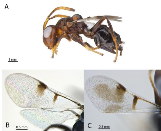
Figure 2. Hexacladia smithii (Ashmead, 1891) (Hymenoptera: Encyrtidae). (a) body, lateral view; (b) male fore wing; (c) female fore wing.